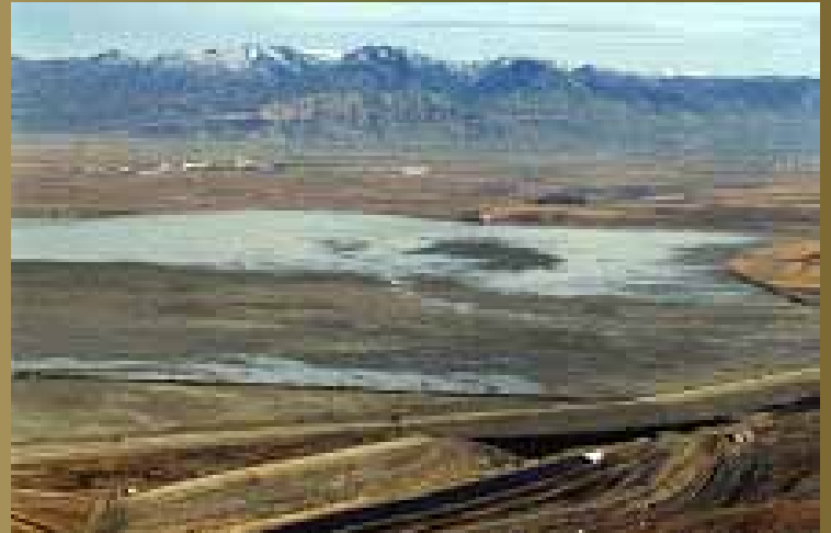
Figure 1. Kennecott Bingham Canyon Mine in Utah. (Left) Tailings impoundment (roughly 9,000 acres) with the Great Salt Lake at the top left. The pit is 0.75 miles deep, 2.5 miles wide, and covers 1,900 acres. (Right) Tailings are shown in the foreground (grey) with Salt Lake City in the background. Operations produced a 60 square-mile groundwater plume under valley to right, mostly from waste rock seepage. As of 2006, Kennecott had spent $370 million on cleanup and source control, and will be required to pump and treat aquifer water for at least the next 40 years. By 2009, 2.7 billion gallons of water will be treated annually to supply homes unable to use the aquifer.

this process usually stops when mining ceases. Inevitably, some of the “chemical soup” seeps out into the surrounding ground and surface waters.